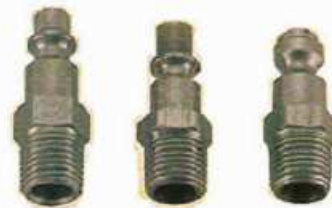
MILTON ARO TURE-FLATE